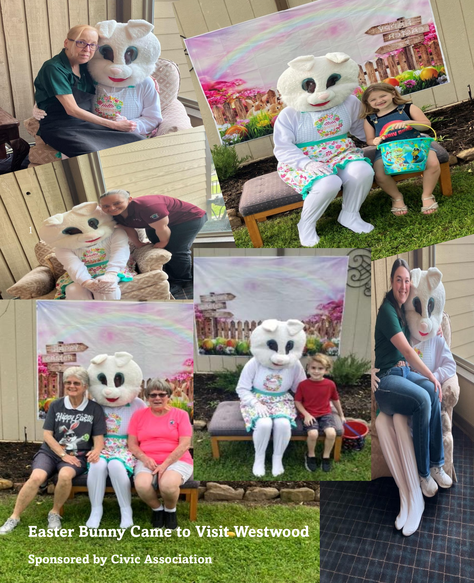
Easter Bunny Came to Visit Westwood Sponsored by Civic Association