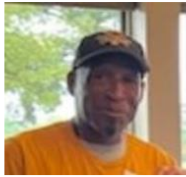
BARNARD PROCTOR MAINTENANCE